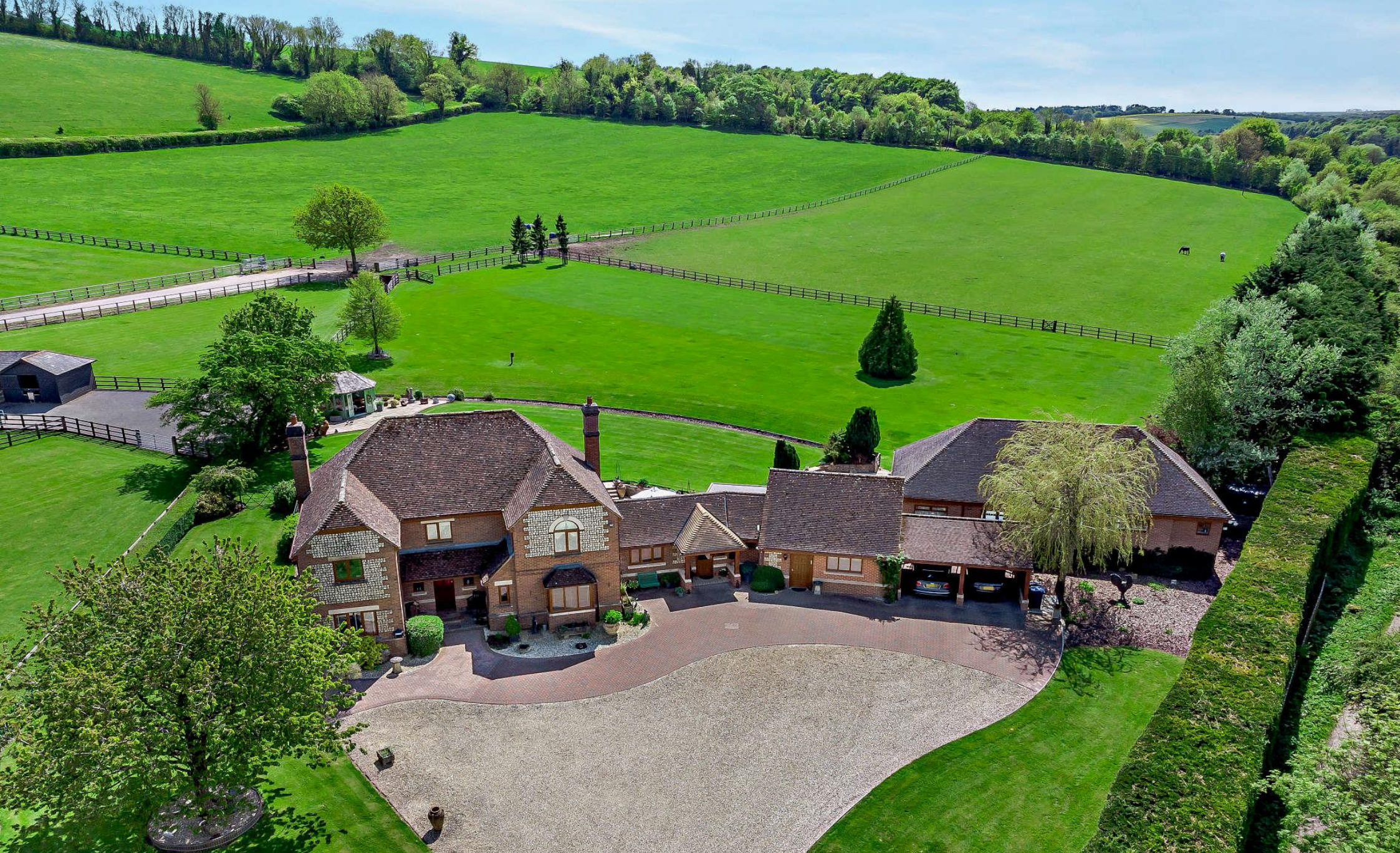
Poulton Down Farmhouse, Ogbourne St Andrew, Marlborough, Wiltshire SN8 1RZ